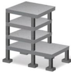
R/C Building 2009